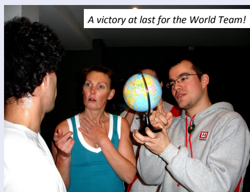
A victory at last for the World Team!

In a classic encounter that went down to the last match The Rest of the World defeated Willoughby for the first time 14-12 recently.